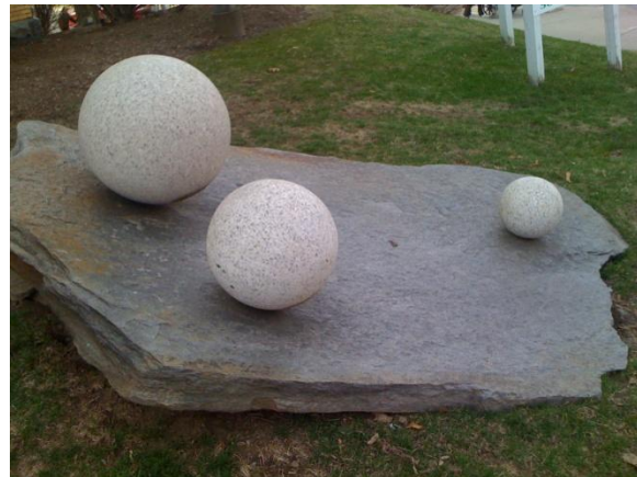
Public art sculpture in front of the Northampton Center for the Arts Old School Commons