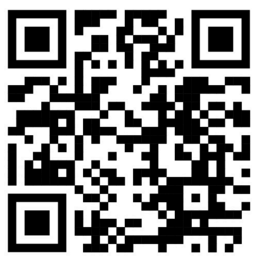
Parking Lot map!!